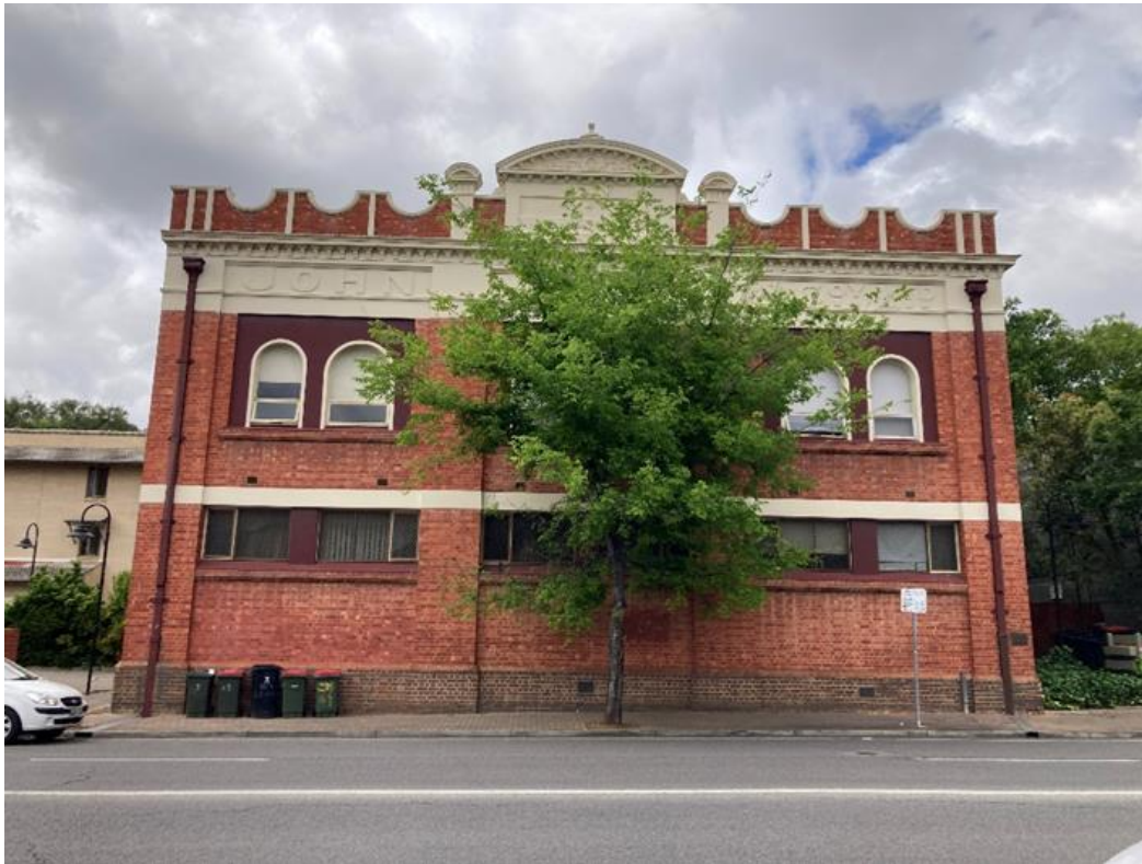
Image: Former John Martin's Warehouse – now adaptively reused for living quarters.