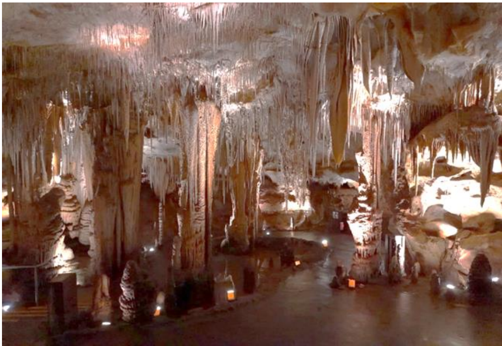
Image: The interior of Tantanoola Tourist Cave. Source: DEW files 7 February 2023

At its 19 October 2023 meeting, the Council confirmed the provisional entry of Tantanoola Cave Complex in the South Australian Heritage Register under criterion c) of Section 16 of the Heritage Places Act 1993 and also designated this place as a place of geological and speleological significance pursuant to section 14 (7)(a) of the Heritage Places Act 1993 .