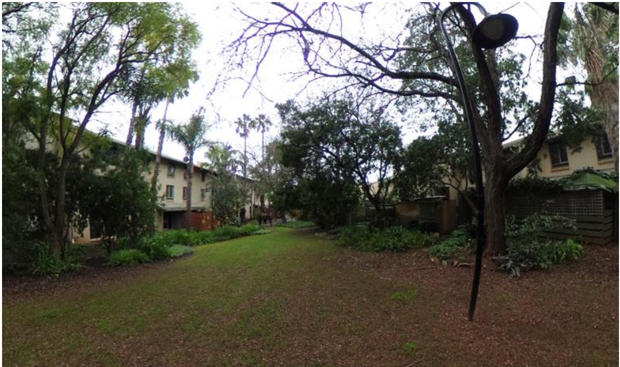
Image: Dr Kent's Paddock. Central communal open space/garden, looking east, with flats to left side of image and townhouses with private courtyard gardens to right side of image.