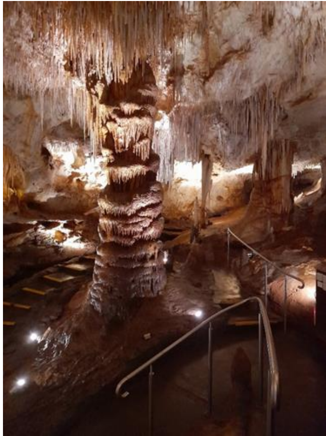
Image: The interior of Tantanoola Tourist Cave including the wedding cake formation Source: Dew Files 7 February 2023