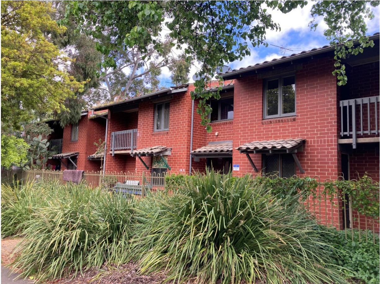
Image: Dr Kent's Paddock Housing Complex.