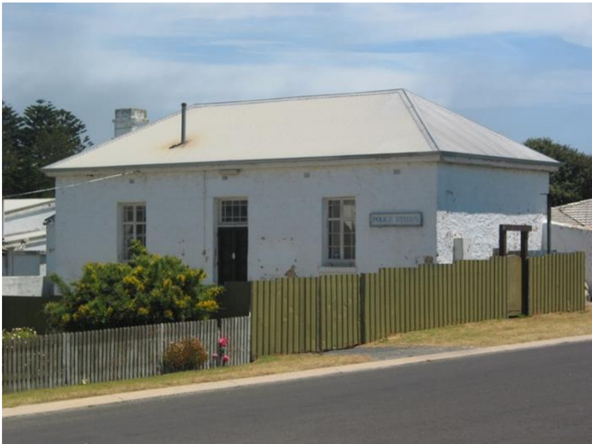
Image: View to front of the Courthouse in December 2003. The roof sheeting has been replaced and the 'Police Station' sign is still on the building

This place was confirmed as a State Heritage Place on 24 March 1983.