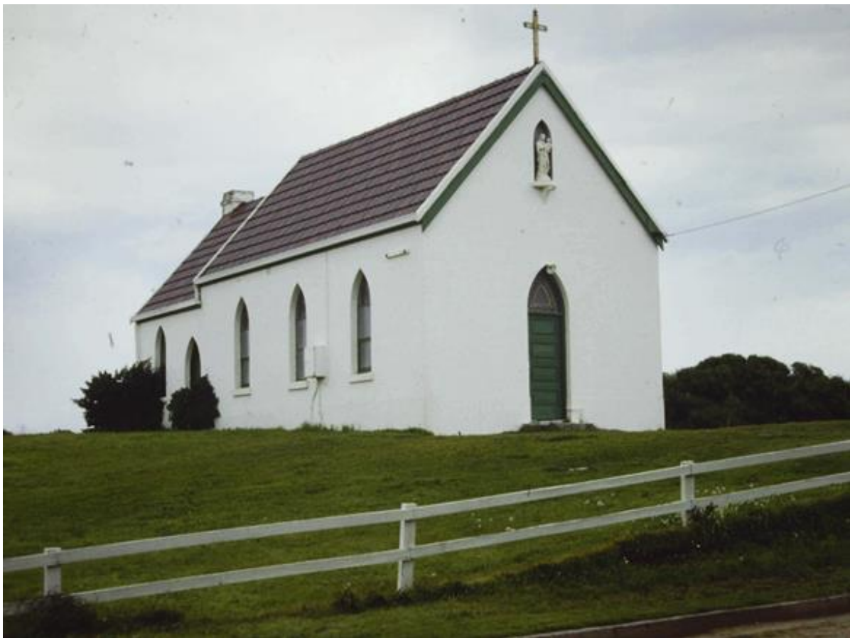
Star of the Sea Church.

This place was Confirmed as a State Heritage Place on 31 August 1983.