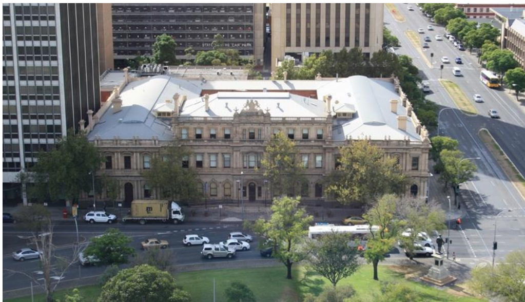
Image: West Elevation of the Torrens Building

The Torrens Building was confirmed as a State Heritage Place on 28 May 1981.