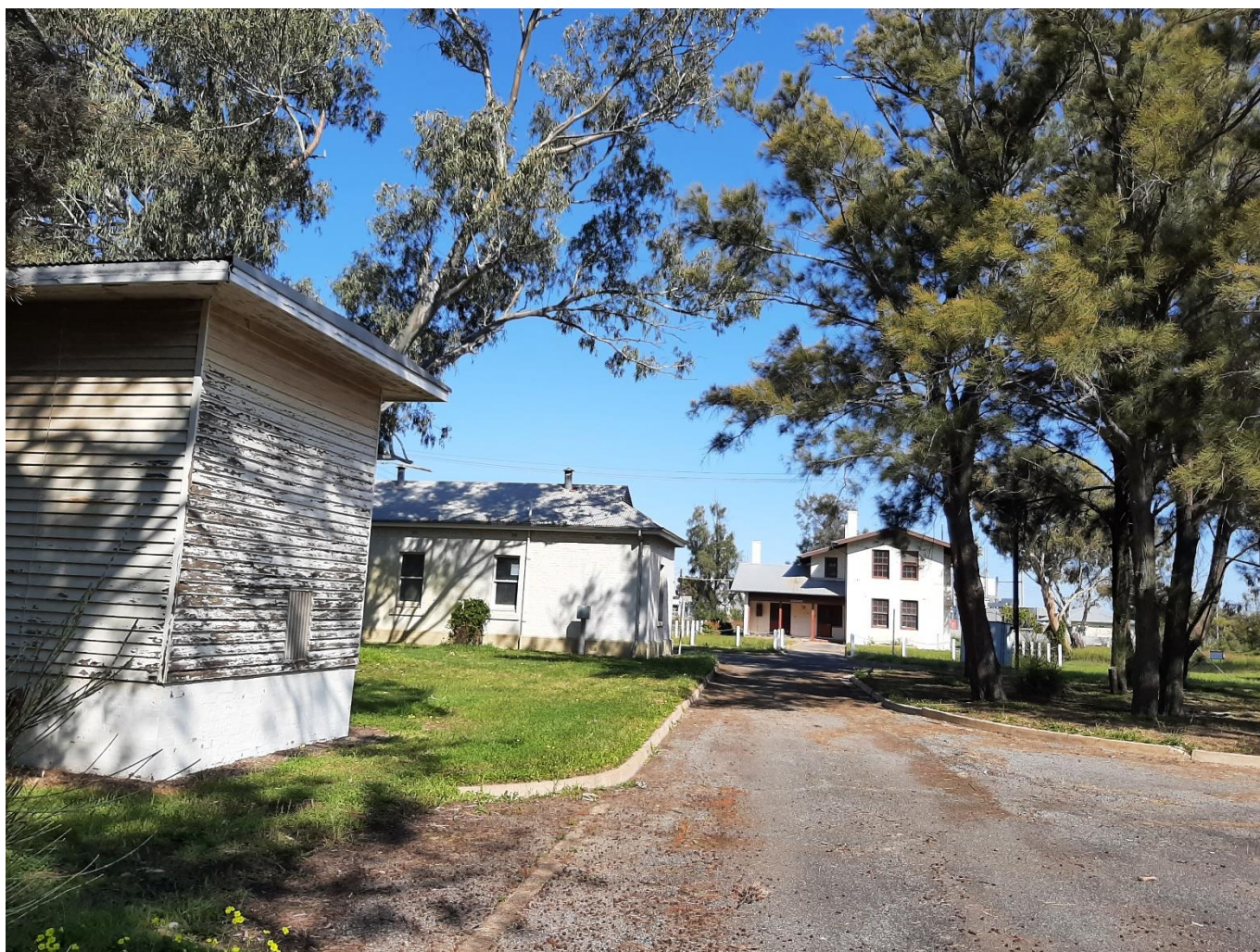
Image: Torrens Island Quarantine Station.

The Torrens Island Quarantine Station including Jetty, Cemetery and Mortuary is a State Heritage Place, registered on 21 October 1993.