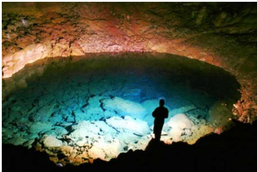
Image: The underground lake in Tantanoola Lake Cave, pink dolomite is distinguishable around the lake's circumference.